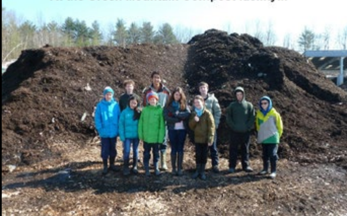
At the Green Mountain Compost facility...