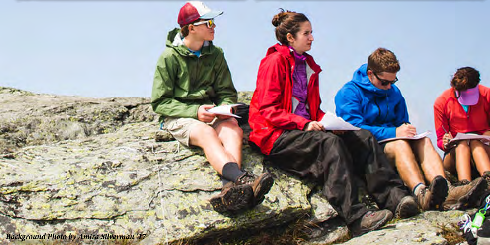
Background Photo by Amira Silverman '17

VERMONT COMMONS SCHOOL - 75 GREEN MOUNTAIN DRIVE, SOUTH BURLINGTON, VT 05403 P: 802-865-8084 F: 802-865-2429 EMAIL: INFO@VERMONTCOMMONS.ORG