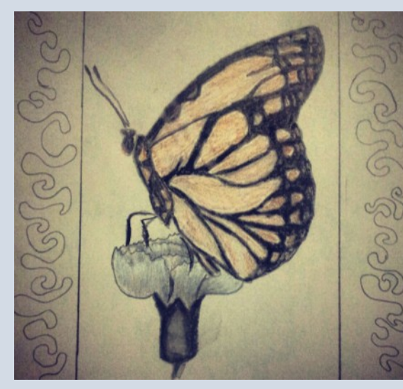
Sketch by Auburn Sendra, '16