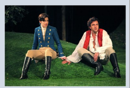
The costume look we are going for

Thanks very much in advance! On behalf of the cast, we look forward to seeing you on April 5th and 6th at 7 pm at Contois Auditorium, located in City Hall on Church Street!